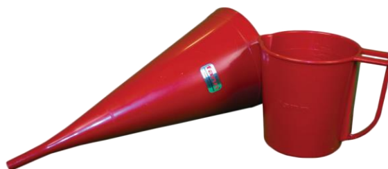
No. 201 Marsh Funnel and No. 202 Measuring Cup